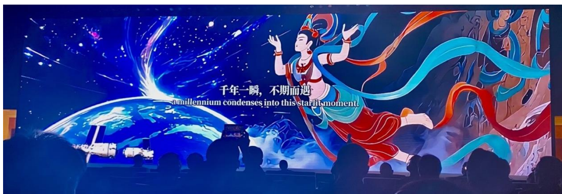
Picture 2: A still from the video "Soaring Dreams - From Mogao Caves to Space Station"

At the end of the first segment of the opening session , a short documentary was shown demonstrating how ceramics in art and artisan craft can serve as a tool for multicultural exchange, using as an example the city of Linxia, often referred to as the international “capital of ceramics”. Moreover, ceramics are increasingly used in modern technologies, especially in astronautics and ocean engineering. This is due to their specific physical, chemical, and mechanical properties.